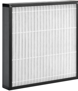
Z-LINE FILTER, CONSTRUCTION PLA