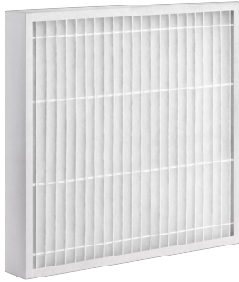
Z-LINE FILTER, CONSTRUCTION NWO