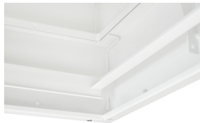
Test groove, detail