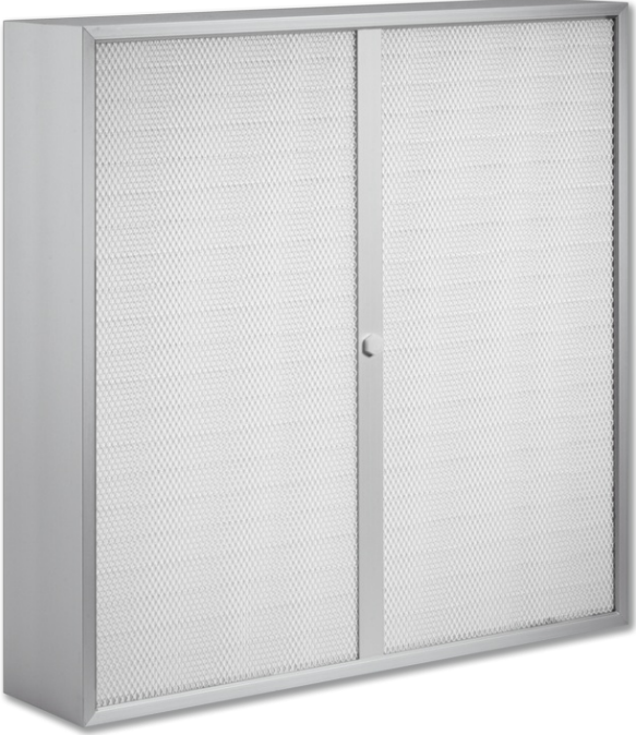
FHD – Construction with centre mullion