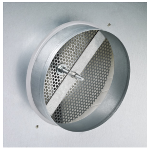
SPIGOT WITH ADJUSTABLE BAFFLE PLATE