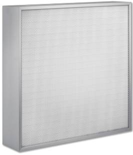
FHD &#X2013; CONSTRUCTION WITHOUT CENTRE MULLION