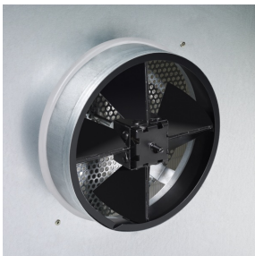
SPIGOT WITH DAMPER BLADE