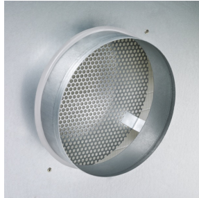
SPIGOT WITH FIXED BAFFLE PLATE