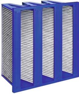
ACTIVATED CARBON FILTER INSERT, TYPE ACFI