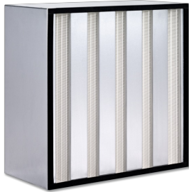
MINI PLEAT FILTER CELLS, TYPE MFC