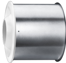
TJN WITH OUTER CASING