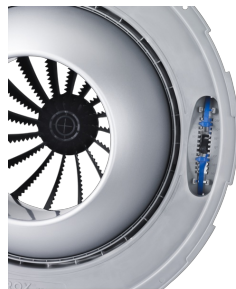
DISCHARGE ANGLE INDICATOR