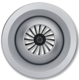
SWIRL UNIT AND CAP FOR THROW DISTANCE REDUCTION